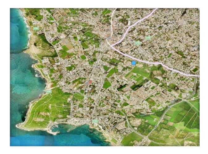
Fig. 1. Satellite of 3Dof Pafos

Pafos, a European town of the 21<sup>st</sup> Century at the crossroads between Europe, Asia and Africa, is a town with monuments of unique value from every period of its rich cultural tradition. The town of Pafos attracts a significant number of visitors every year, mainly as a result of its unique cultural heritage, and its location. Pafos as European Capital of Culture for 2017 aims at developing a strategic sustainable plan to re-invent the town as a cultural landscape used as a tourist development tool. The aim is to re-invent Pafos as an open-air space which will host numerous activities, cultural in the vast sense and artistic: an Open-Air Factory for humanity, art and culture, with events throughout the year and throughout the entire District of Pafos (Fig 1). Such a sustainable intervention may also serve as a reference case study of future urban development and landscape restoration which will introduce an innovative strategy supporting an integrated, sustainable development of historic urban areas, strengthening their attractiveness and competitiveness by capitalizing on cultural heritage assets.