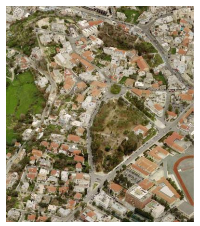
Fig. 2 The existing public garden and the surrounding space

The Pafos 2017 Organisation aims at unifying the green spaces around the town's main green space (the Public Garden). This intervention extends to the area of the Central Fountain and the Mousallas area, unifying these in a single central walkway, which includes the Cathedral and the Ethnographic Museum as landmark (Pafos 2017, 2014). This way the green area integrates into a major public open space to be given for usage by the citizens, thus correcting a long term planning issue.