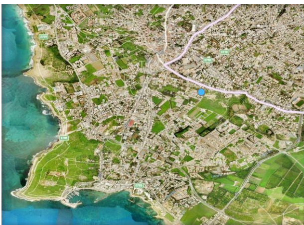
Fig. 1. Satellite of 3Dof Pafos

Pafos, a European town of the 21 st Century at the crossroads between Europe, Asia and Africa, is a town with monuments of unique value from every period of its rich cultural tradition. The town of Pafos attracts a significant number of visitors every year, mainly as a result of its unique cultural heritage, and its location. Pafos as European Capital of Culture for 2017 aims at developing a strategic sustainable plan to re-invent the town as a cultural landscape used as a tourist development tool. The aim is to re-invent Pafos as an open-air space which will host numerous activities, cultural in the vast sense and artistic: an Open-Air Factory for humanity, art and culture, with events throughout the year and throughout the entire District of Pafos (Fig 1). Such a sustainable intervention may also serve as a reference case study of future urban development and landscape restoration which will introduce an innovative strategy supporting an integrated, sustainable development of historic urban areas, strengthening their attractiveness and competitiveness by capitalizing on cultural heritage assets.