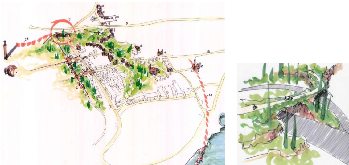
Fig. 4, 5: Unification of Archeological Sites.

The existence of such an extensive archaeological zone, closely neighbouring the modern town, is the most important detail of the identity of Pafos. Designated a World Heritage Site by UNESCO, the archaeological legacy of the ancient capital of Cyprus, Nea Pafos, needs to restore its bonds with history, and to enhance its new image in continuation thereof and in harmony therewith (Pafos 2017, 2014). The Unification of the Archaeological Sites represents an important change in Pafos since the archaeological sites and monuments will regain their significance, dominating the landscape, as they will become part of everyday life. By incorporating into the life of the town monuments covering the entire historical span, both citizen and visitor may experience the historical continuity of the town in an environment of improved cultural, educational and aesthetic (Pafos 2017, 2014).