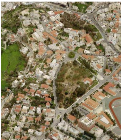
Fig. 2 The existing public garden and the surrounding space

The Pafos 2017 Organisation aims at unifying the green spaces around the town's main green space (the Public Garden). This intervention extends to the area of the Central Fountain and the Mousallas area, unifying these in a single central walkway, which includes the Cathedral and the Ethnographic Museum as landmark (Pafos 2017, 2014). This way the green area integrates into a major public open space to be given for usage by the citizens, thus correcting a long term planning issue.