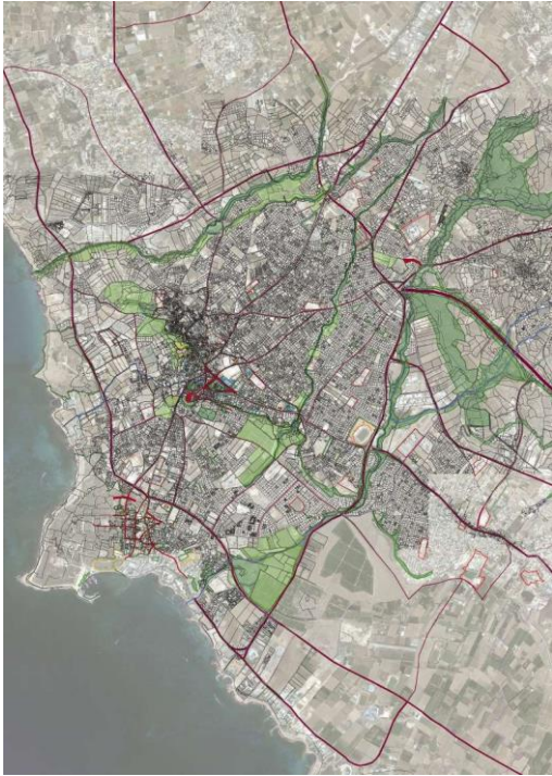
Fig 6.Unification of green spaces and greenways creation